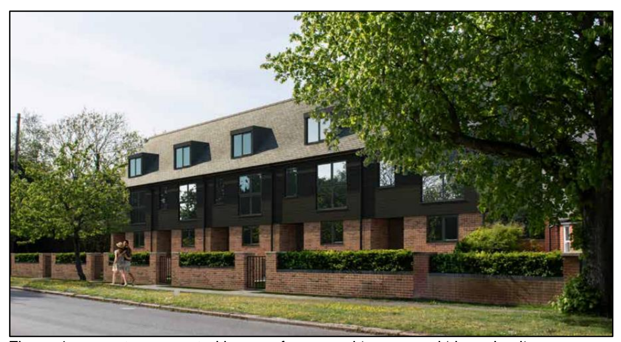
Figure 4: computer generated image of proposed terrace and 'dormy' unit

3.5 The proposed terraced houses facing onto St Andrews Road take the traditional form of a row of terraced houses, in line with adjacent existing residential development. There would be four x 3-bed units, arranged over three floors, but with the third floor within the roof space and served by dormer windows to the front elevation and gables to the rear. Each unit would have a front and rear garden area. The 'dormy' unit would sit on the western end and would have a pair of twin rooms on each of the three floors, with bathrooms but no cooking facilities, all served by a staircase. Proposed materials are red brick to the ground floor, dark-stained timber to the first floor and slate to the roof, as can be seen in figure 4 below, a computer generated image supplied by the applicant.