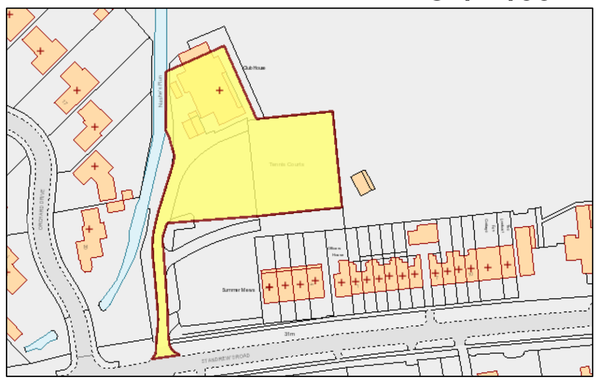
Figure 1: area of asset of community value